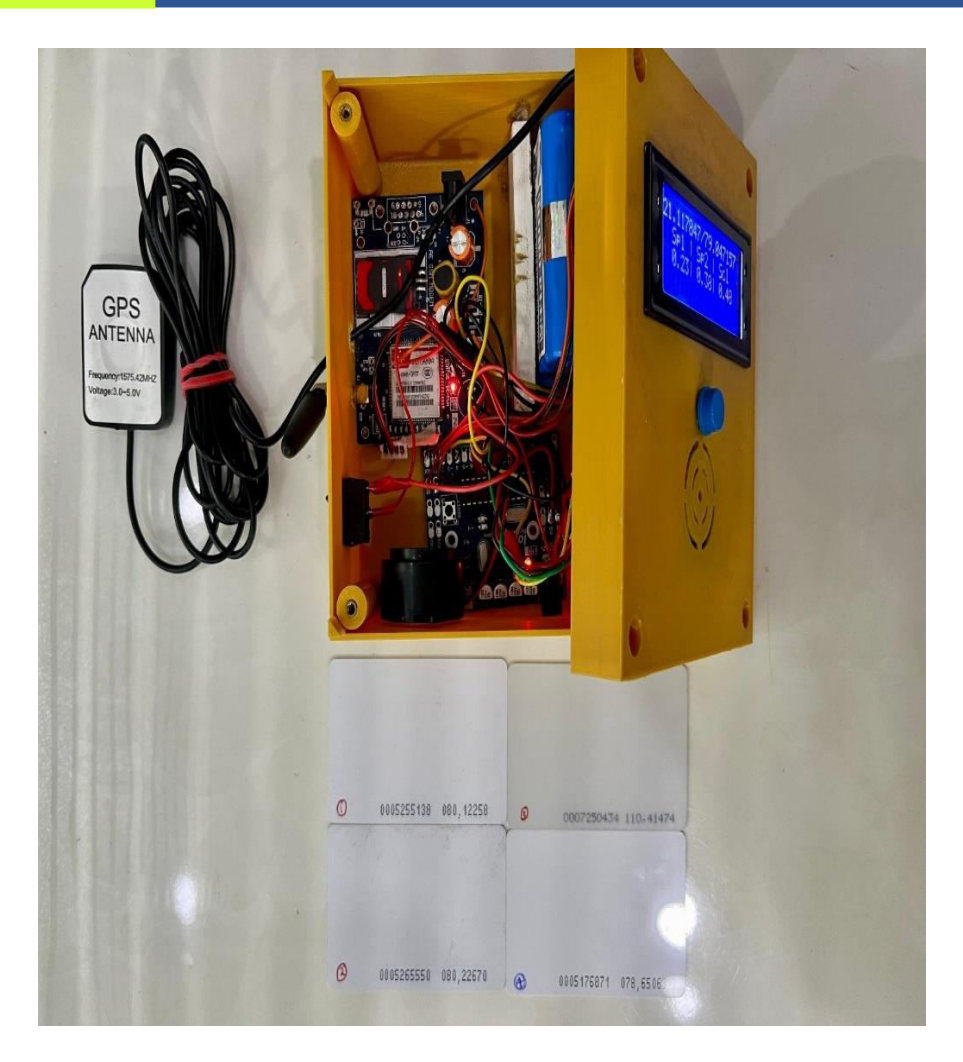
Fig(iii) Encloser Box with System Hardware Assembly and Battery Power Source.

(A Monthly, Peer Reviewed, Refereed, Scholarly Indexed, Open Access Journal)