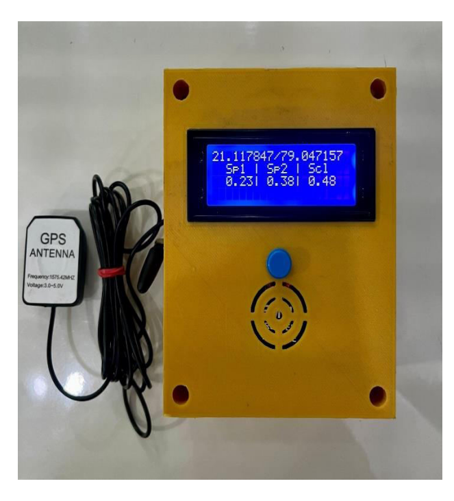
Fig(i) Project Model