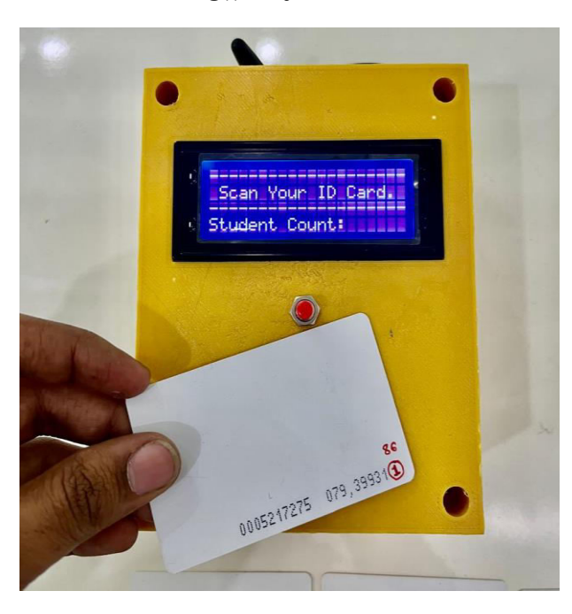
Fig(ii) RFID Card Scanning by Student for Attendance Management